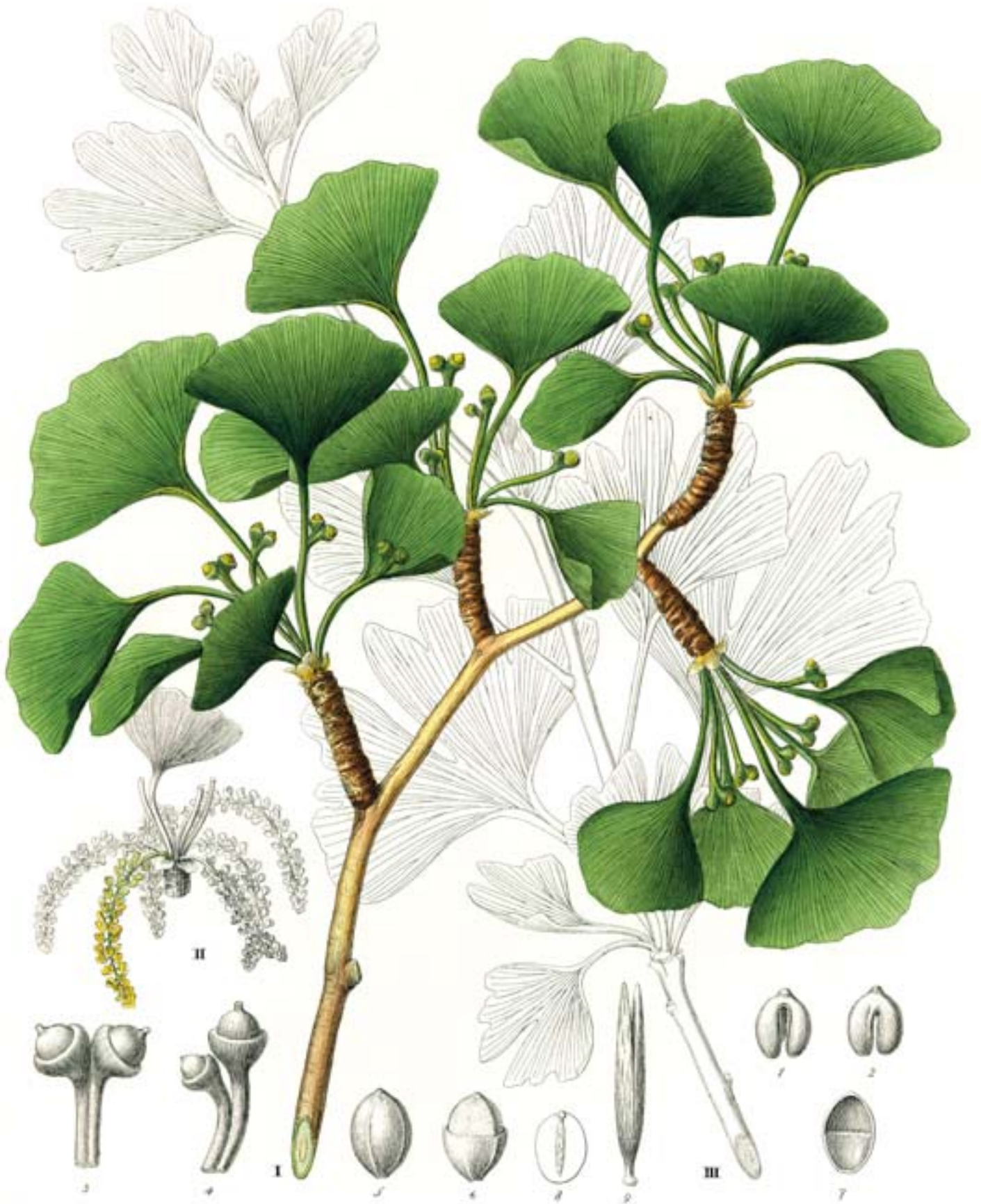
FAN-SHAPED LEAVES of the ginkgo tree are shown in this drawing from Flora Japonica , a book written by 19th-century German physician Philipp Franz von Siebold. The extract obtained from the leaves ( inset on opposite page ) is one of the most widely used herbal treatments aimed at improving memory.