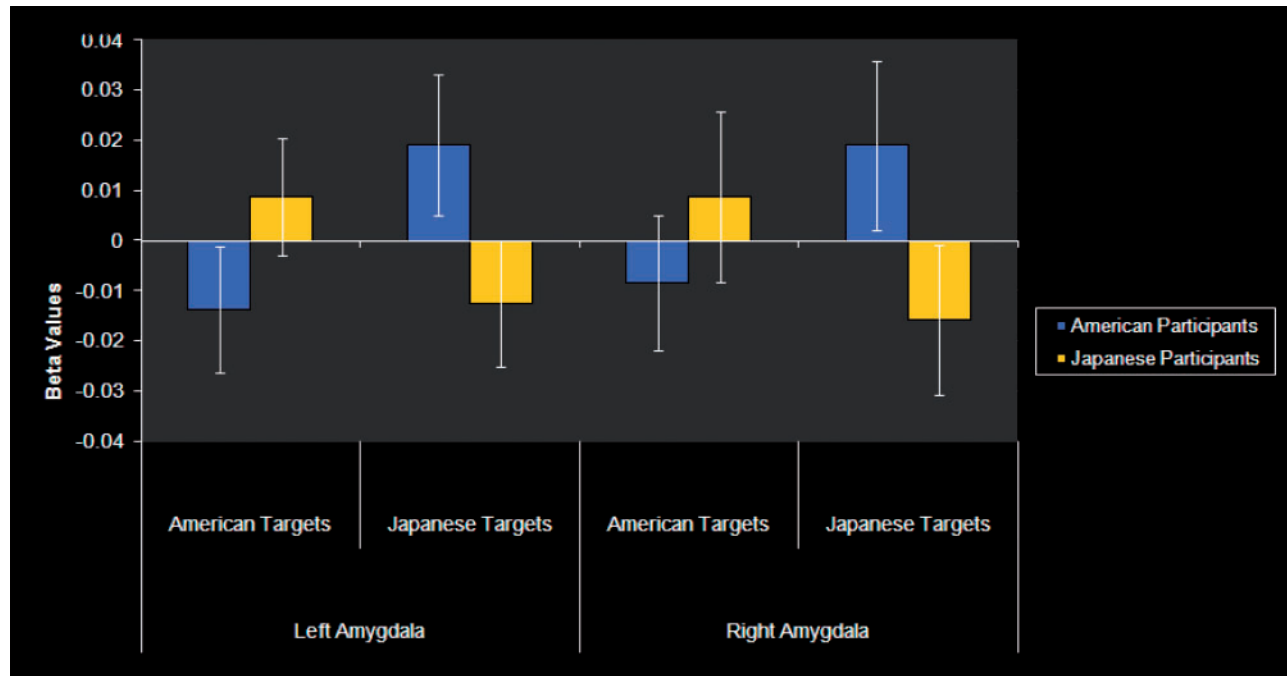
Fig. 2 Mean beta values showing the participant culture by target culture interaction, plotted separately for the left and right amygdalae. Participants showed a greater response to opposite-culture, outgroup targets.

significant clusters of activation for voted over not-voted targets in the right (Talairach Coordinates: 22, -2, -23; 192 mm 3 ) and left (Talairach Coordinates: -22, -6, -20; 275 mm 3 ) amygdalae, as well as in the left superior temporal gyrus (Talairach Coordinates: -41, 2, -15; BA 38; 449 mm 3 ) and right inferior frontal gyrus (Talairach Coordinates: -29, 10, -15; BA 47; 409 mm 3 ). The target culture × participant culture interaction showed two clusters of significant activation: one in the left superior frontal gyrus (Talairach Coordinates: -19, 39, 36; BA 9; 175 mm 3 ) and a second in the left culmen of the cerebellum (Talairach Coordinates: -9, -34, -17; 293 mm 3 ). Mean extracted beta values from these clusters showed an outgroup effect, similar to what we observed in the amygdala ROI analyses above. Specifically, Japanese participants showed a greater response to outgroup, American targets and American participants showed a greater response to outgroup, Japanese targets in both the cerebellar culmen and the superior frontal gyrus.