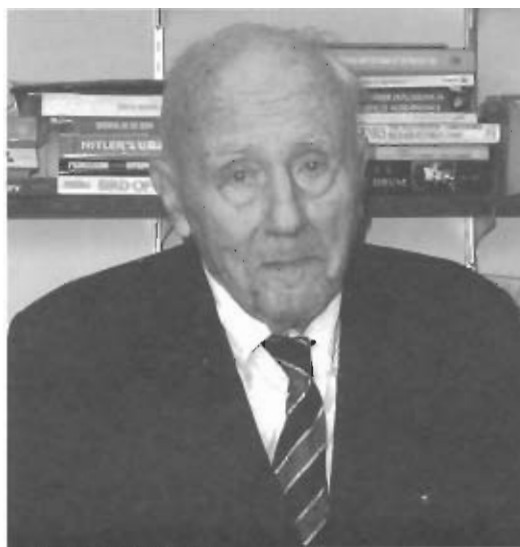
Professor John Wheeler

Quantum Foam: A Life in Physics (1998), is the contributor of this article. He is a frequent visitor to Jadwin Hall, driving up from his Philadelphia home at least two or three times each month to visit with Wheeler and assist with correspondence.